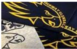
Spirit Wear Day!

The student who brings in the most Tax Credits will win: