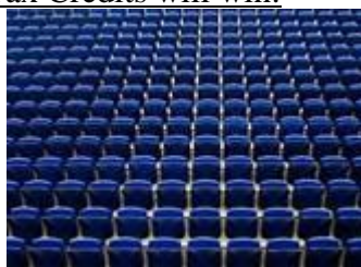
Prime seating at the Archway Glendale Concert for your family!

Contest ends midnight, December 31st, 2019! To contribute, go online to http://www.archwayglendale.org/support .