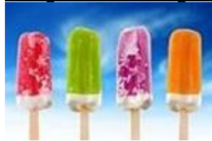
An Ice Cream Party!

The grade that brings in the most tax credits will win: