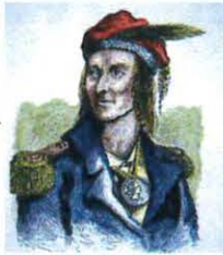
Tecumseh (1768-1813), chief of the Shawnee

Vocabulary game , n. animals that are hunted for sport or for food