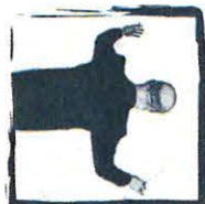
La Mer (for orchestra)

12 Jimbo's Lullaby from Children's Corner Suite