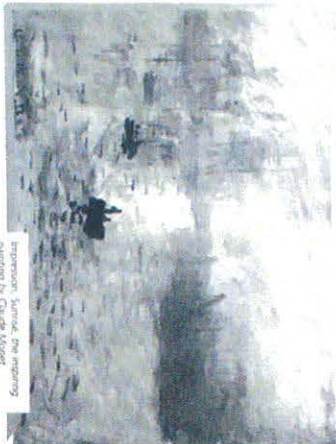
Impression, Sunrise, the painting inspiring the name of the Impressionist movement, by Claude Monet.

The name for this Impressionistic Period came from a painting, Impression, Sunrise, by Claude Monet.