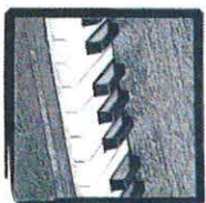
Children's Corner Suite (for piano) Clair de lune (for piano)