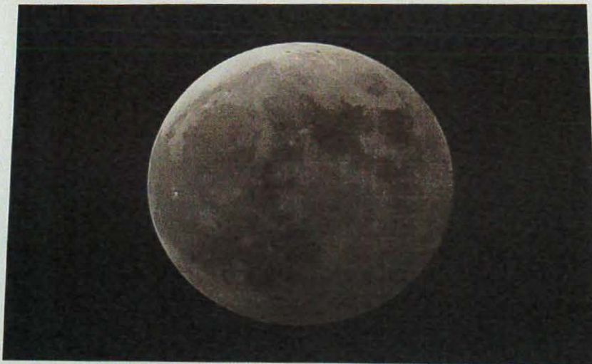
Total lunar eclipses occur when the moon is full.

lunar eclipse, n. an event during which the moon passes directly behind Earth and into its shadow