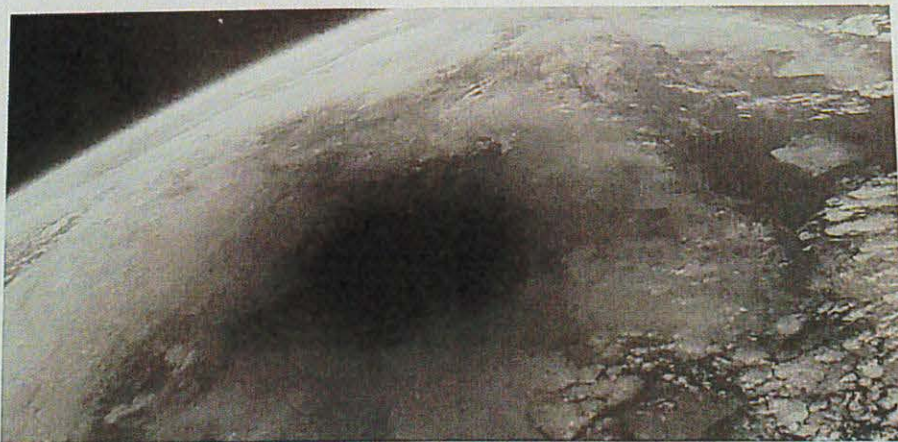
Satellites in orbit can capture photos of the moon's shadow passing across Earth's surface during a total solar eclipse.

Science: Continue to look at the moon nightly and draw a picture on your paper with the date.